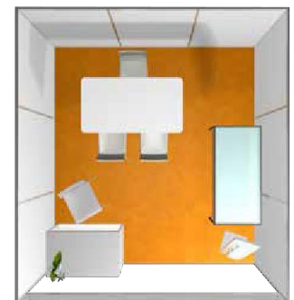
Image shows example of 9m 2 stand