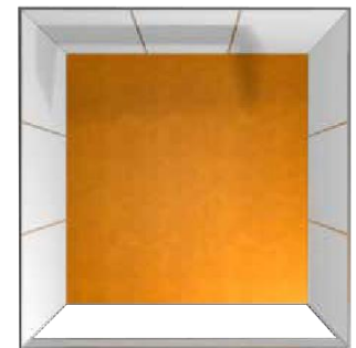
Image shows example of 9m 2 stand