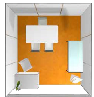
Image shows example of 9m 2 stand