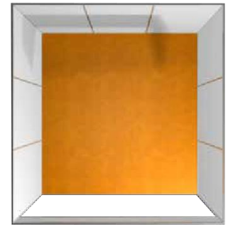
Image shows example of 9m 2 stand