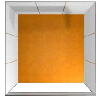
Image shows example of 9m 2 stand