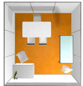
Image shows example of 9m 2 stand